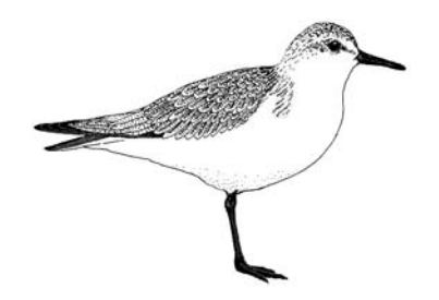
Sanderling : I nab insects on the surfact of the soil with my beak.